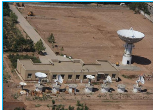
Kashgar Observation Station