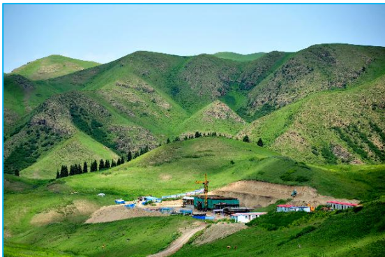
Qitai Observation Station