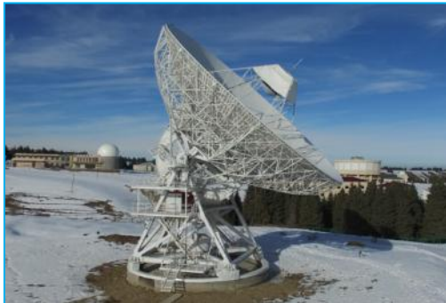
26-m radio telescope

XAO is currently equipped with a 26-m radio telescope, a 1-m wide-field optical telescope, a 1.2-m wide-field optical telescope, a solar photosphere/chromosphere telescope and a GPS receiver system. In addition, a large fully-steerable single-dish radio telescope (110-m in diameter), known as the Qitai Radio Telescope (QTT) will be built in Qitai County, Xinjiang. XAO's QTT project represents a new research campaign, and our innovative team is always looking for dedicated and creative researchers who are flexible and open to new challenges to join the observatory.