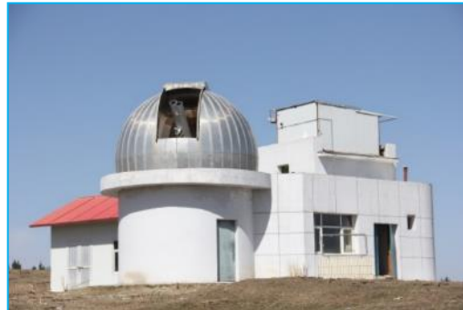
solar photosphere/chromosphere telescope