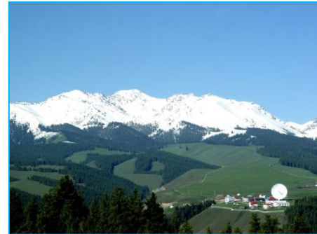
Nanshan Observation Station